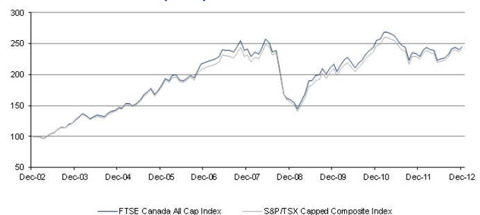
Index Performance (CAD) – 2003 to 2012

Sources: FTSE, S&P Dow Jones Indices, Dimensional Returns 2.0